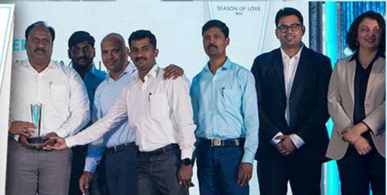
Best Independent Store - Platinum Sales South