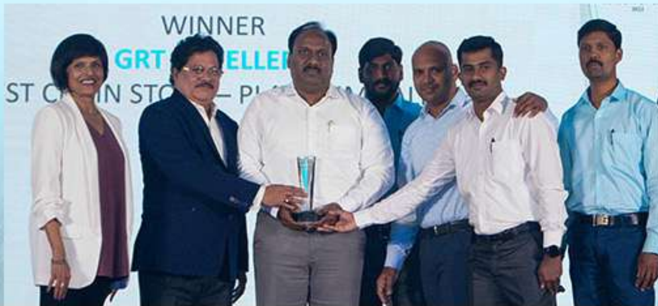
Best Independent Store - Platinum Sales North