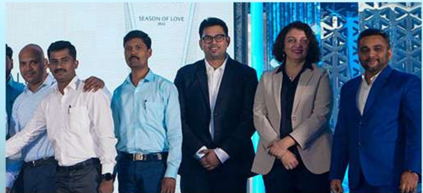
Best Independent Store - Platinum Sales South

Vummidi Bangaru Jewellers, Anna Salai, Chennai