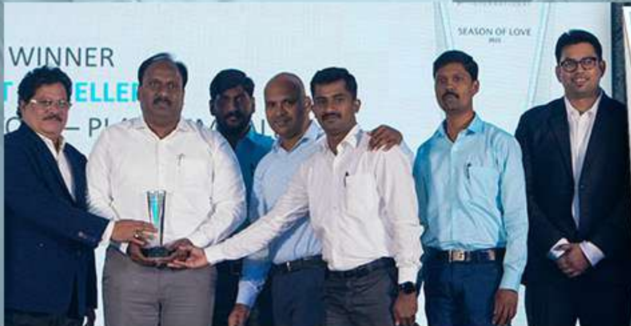
Best Independent Store - Platinum Sales North

Vummidi Bangaru Jewellers, Anna Salai, Chennai